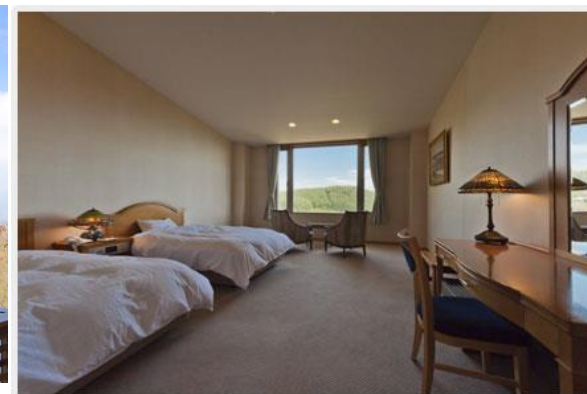
Western Twin Room with ensuite at Hotel Arcadia (Togakushi)