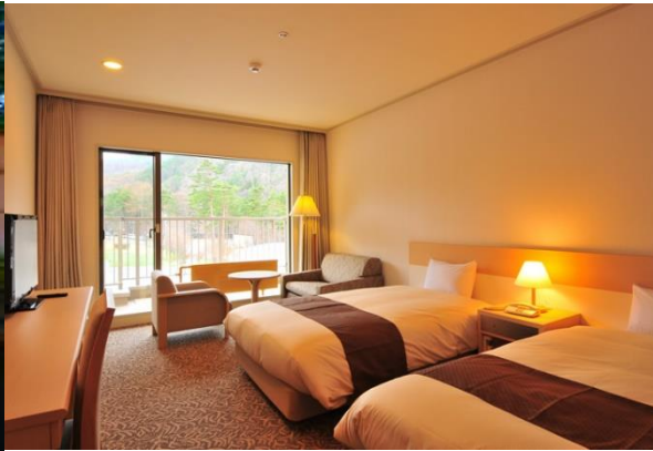
Western Twin Room with ensuite & outdoor onsen at Holiday Yu Shikinosato (Azumino)