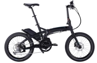
E bike Tern Vektron S10 (fold bike) Tires: 20 x 2.3 Shift: R10 speed Brake: Flood control disc Size: one size

Frame with good vibration absorption and less fatigue even over long distances