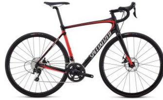
Carbon Road Bike Specialized Roubaix, Ruby Tire: 700 × 26C Shift: F2 x R10, F2 x R11 Brake disc Size: Ruby 44,48,51 Roubaix 49,52,54,56,58

Frame with good vibration absorption and less fatigue even over long distances