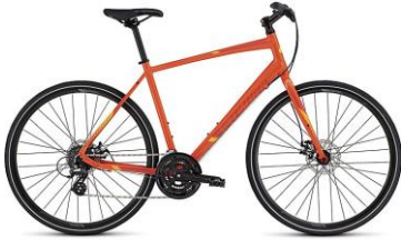
Cross Bike Specialized Sirrus, Vita Tire: 700 × 32C Shift: F3 x R8, F2 x R9 Brake disc Size: Vita XS, S Sirrus XS, S, M, L, XL