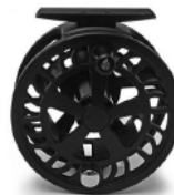
TIEMCO ORCLE SINGLE HAND VI TIEMCO ORCLE SINGLE HAND V