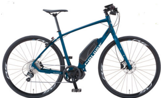
MIYATA CRUISE 6180