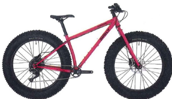
SURLY Ice Cream Truck