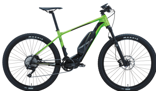
eBIG. SEVEN 600 ヤマハ製 YPJ-XC