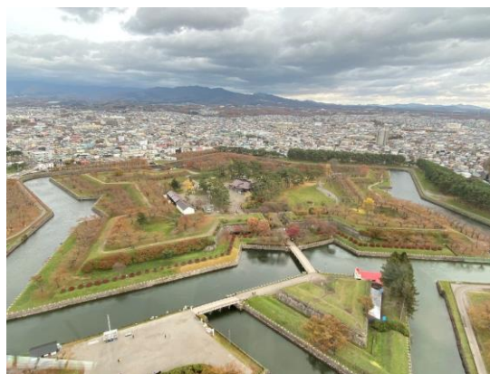
Goryokaku (star shaped)

Welcome dinner is a Western set menu using ingredients from around Hakodate area.